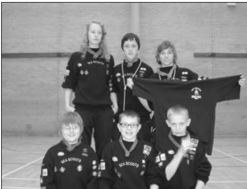
The Scout Team holding an event T-shirt