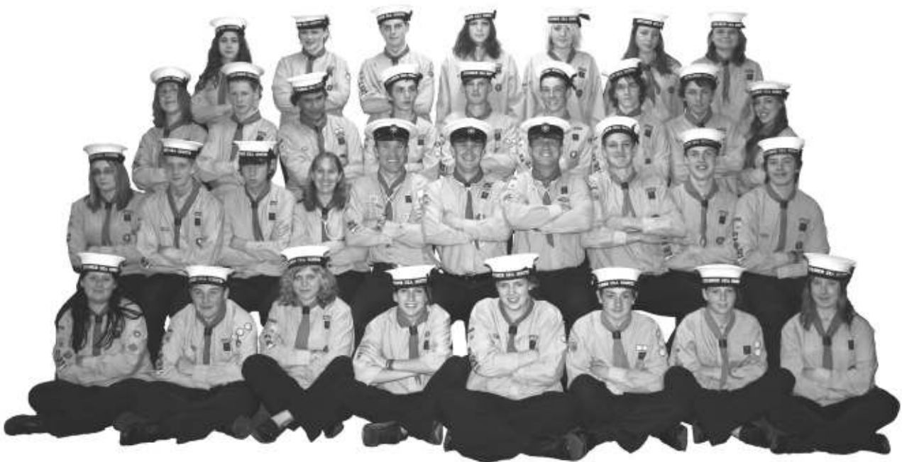
Osprey Explorer Scout Unit - 2nd May 2007