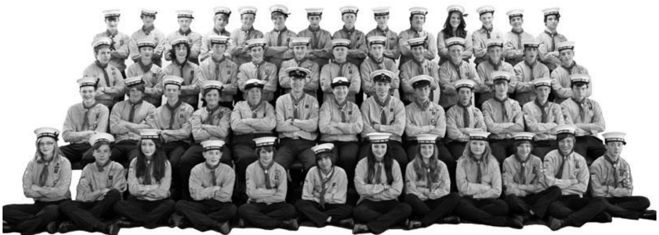
Osprey Explorer Sea Scout Unit - 3rd June 2013

March: We had a UV wide game at Highdown with glow sticks! We helped at the Group supercar track day at Goodwood to raise funds for the new galley. One of our Explorers was sponsored to attend the weeklong Rotary Youth Leadership Awards (RYLA).