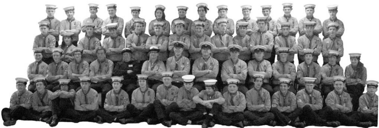
Osprey Explorer Sea Scout Unit - 2nd June 2014

March: We cooked pancakes by candlelight. We tried castaway cooking. We went to the cinema to watch Need For Speed. We had a mobile phone photography competition.